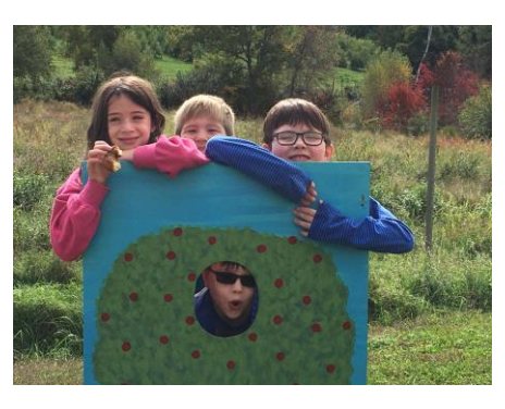
Apple-pickers taking a break