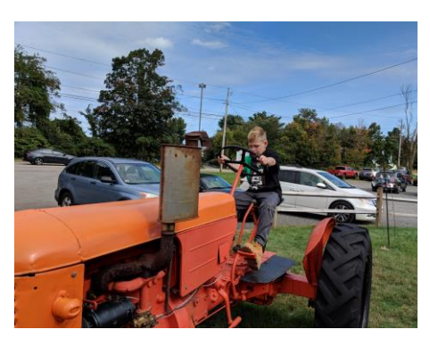
Tractors were also on display

The Office of Faculty Development has collaborated with the BCH Medical Library to create a Wellness Collection. Materials include resources on stress relief, meditation, yoga, achieving optimal health at any age, and a hygge (Danish term that connotes comforting practices) manual for surviving the upcoming winter.